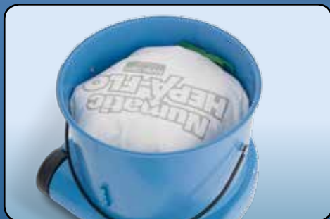
High efficiency HepaFlo bags