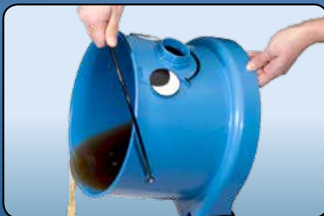
Standard easy emptying handle system