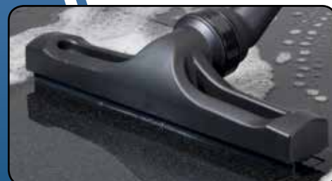
Wet pick-up nozzle