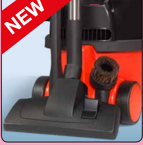
On-board tool storage