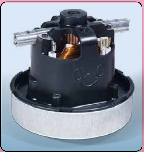
Numatic high efficiency longlife motor