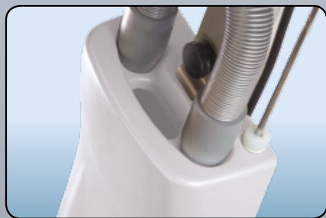
Solution tank option

A full range of 33cm (13") brushes and pad drives allows the machine to be used for all of the primary floorcare functions.