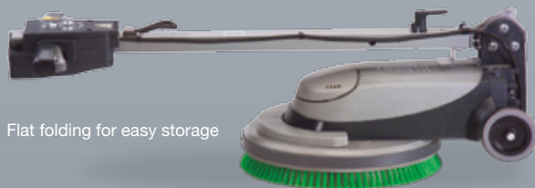
Flat folding for easy storage