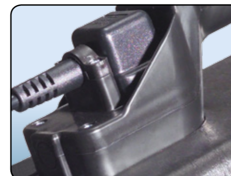
Nucable easy replacement plugged cable system