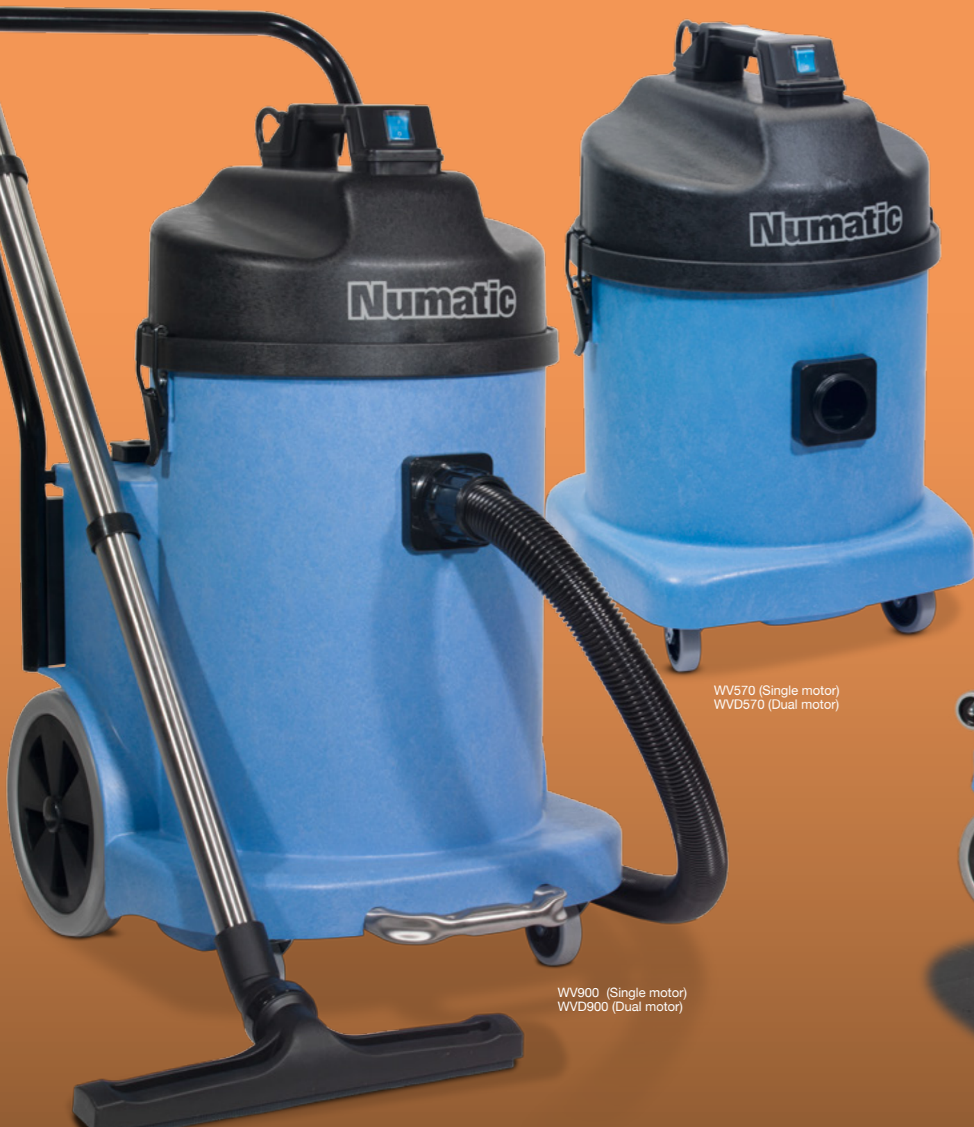
WV570 (Single motor) WVD570 (Dual motor)

EcoWets have now been raised to our full 38mm (1½") standard, providing performance enhancements allowing single motor models to perform to improved standards. Both models use complete Structofoam construction, an exceptionally tough compound that doesn't dent, scratch or deteriorate and yet it is lightweight and resists all standard cleaning chemicals.