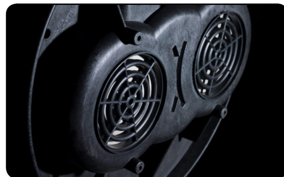
Duplex twin motor power option