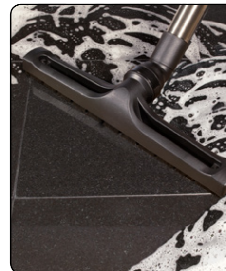
400mm wet pick up nozzle