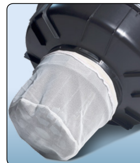
Safety net filter and float assembly