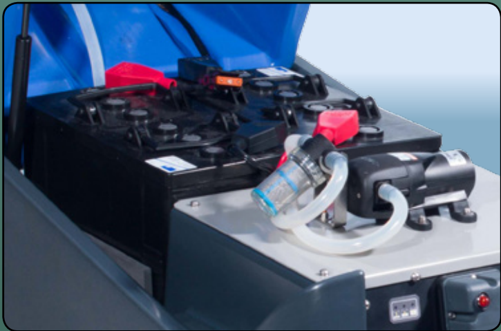
Easy battery access