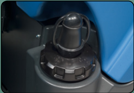
Flexi fill hose