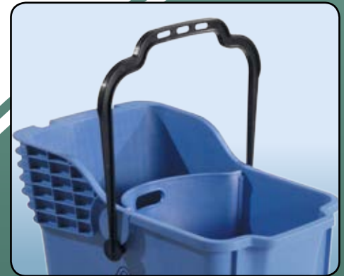
Folding sturdy handle