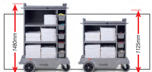
SKAT-11, 12, 21 and 22