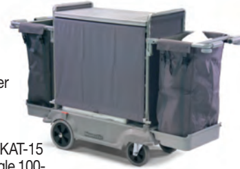
SKAT17 in Nite Mode

A full SKAT-16 specification with the addition of a second 100-litre folding laundry bag extension to the left-hand end.