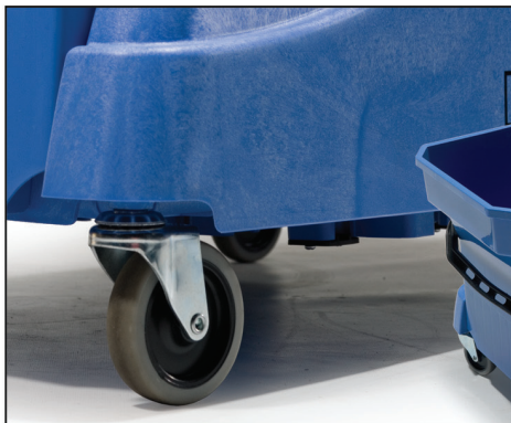
75mm Non-Marking Castors