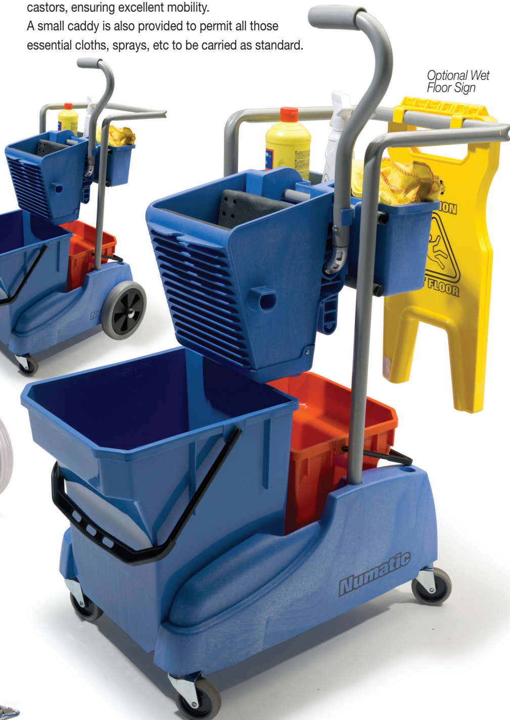
Optional Wet Floor Sign