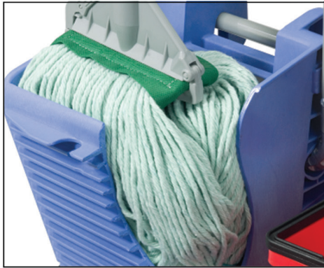
High Efficiency AllMops Press