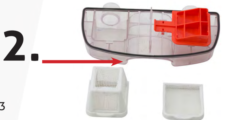
Thoroughly clean top separator hood, filter, basket and seal.