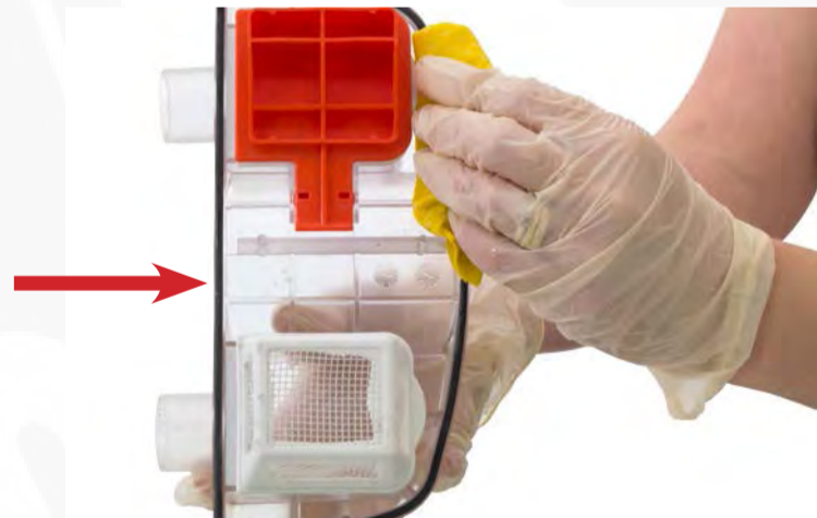
Ensure the separator seal is clean and undamaged. Replace if necessary.