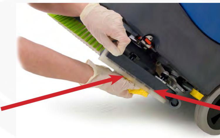
IMPORTANT: Clean underside of squeegee from dirt and debris.