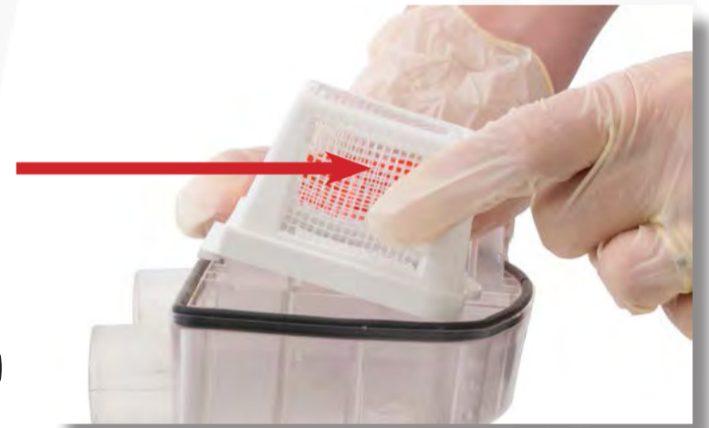
Clean out the debris filter basket located under the separator hood.