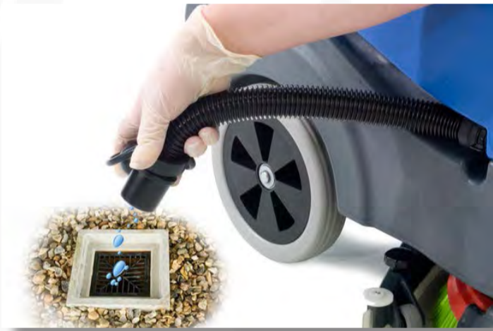
Empty the recovery tank and rinse thoroughly with clean water.