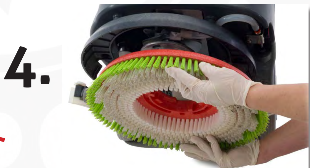
Remove brushes/pad drives and check for wear and damage.