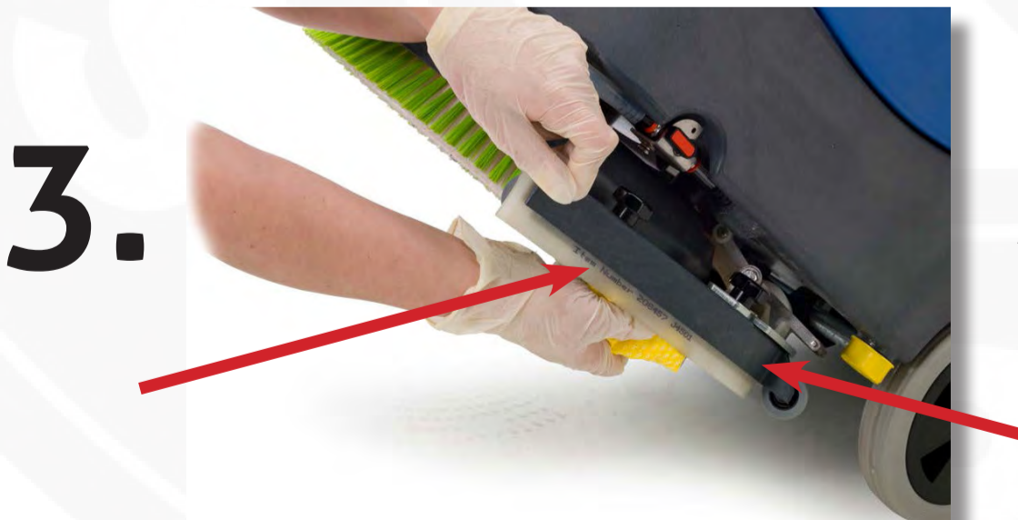
Remove squeegee and check for wear and damage. Clean thoroughly.