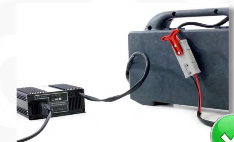
Plug the battery in for charging.