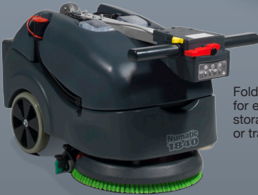
Folds down for easy storage or transit