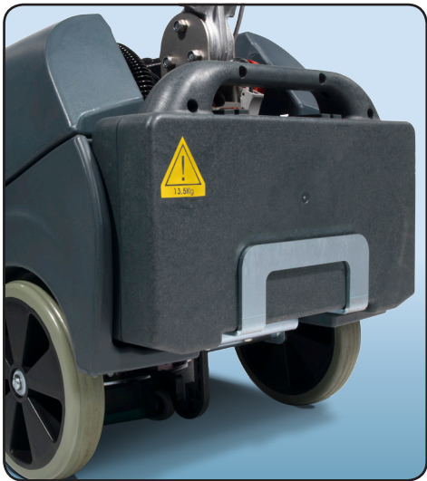
Quick change gel battery pack