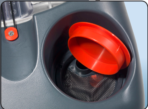
Easy and generous fill cap