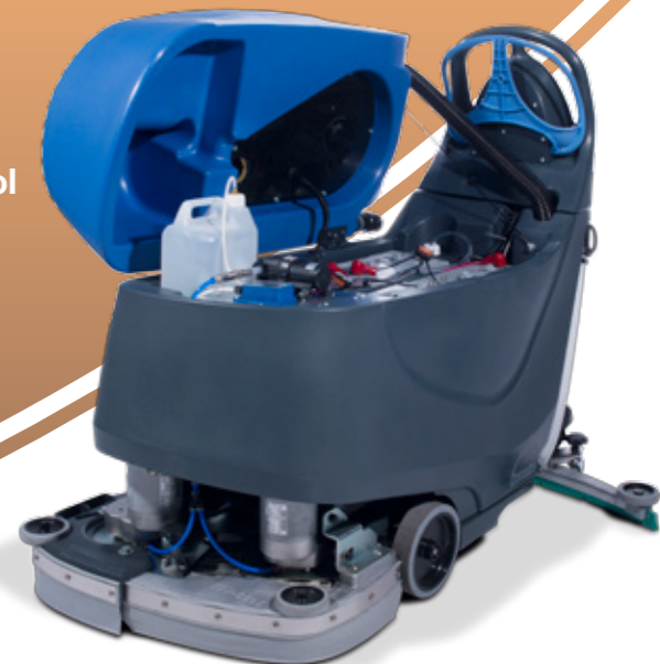
Easy battery access

Beneath the hinged dirty water tank sits the operating heart of the Vario with its 200Ahr gel battery and charging system, high performance suction unit and NuChem dosing facility... all easily accessible.