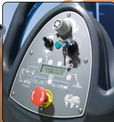
Simple to use Nutronic control panel

The operator controls are a separate feature in their own right with independent selection of speed, water flow and chemical dosing all built in to the basic unit, all of which can be set to provide total convenience and consistency of operation.