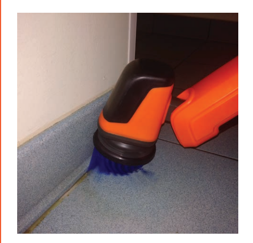
Flooring Edges & Corners