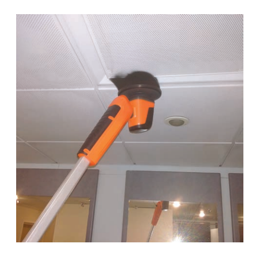
Ceilings & Ventilation Grilles