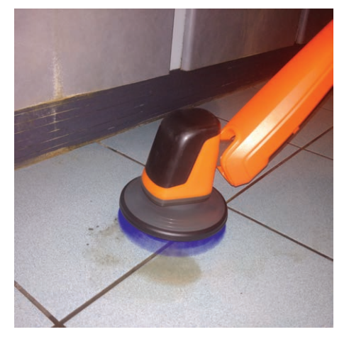
Tiles & Grout

And 100's more time & effort saving applications!