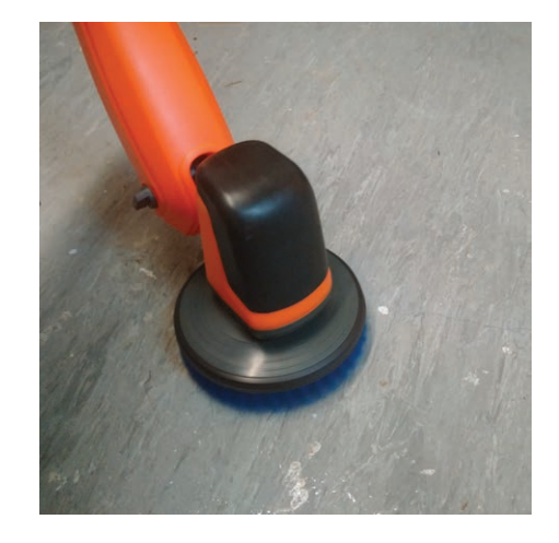
Vinyl & Non-Slip Surfaces