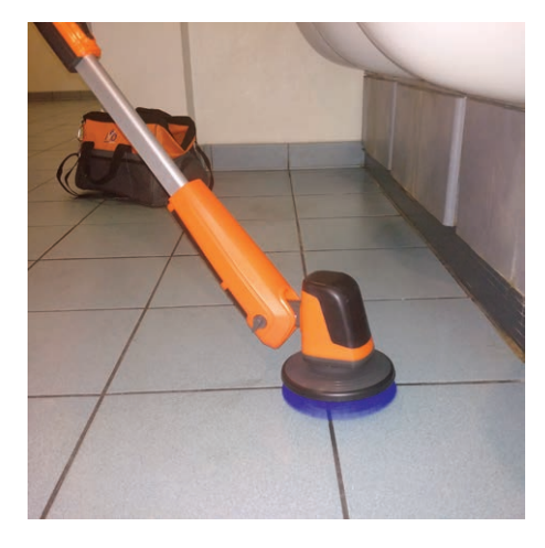
Under Toilets & Urinals