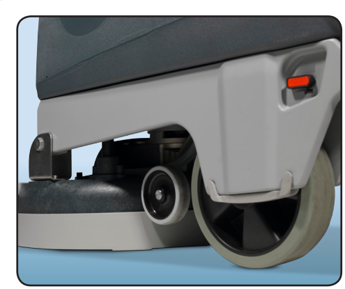
Full moulded chassis and non-marking wheels