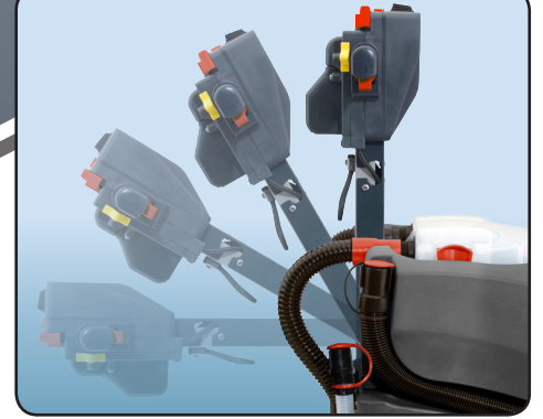
Fully adjustable handle