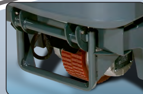
Drive wheel protector

A full 120 litre capacity with a fixed 650mm twin brush power head the TRO650G is ready to go.