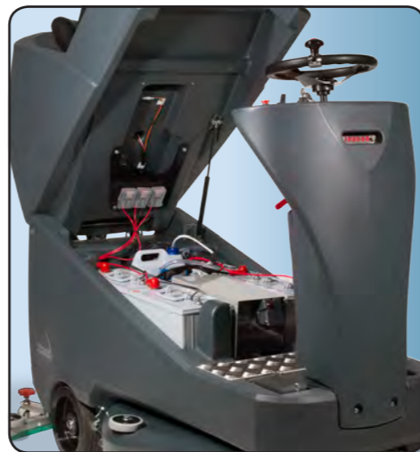
Easy maintenance access

The TRO650G is blessed with a commanding operator driving position, front wheel traction drive, a magnificent turning circle and one pass performance that really will ensure you get the standard you want, exactly when you want it... and fast.