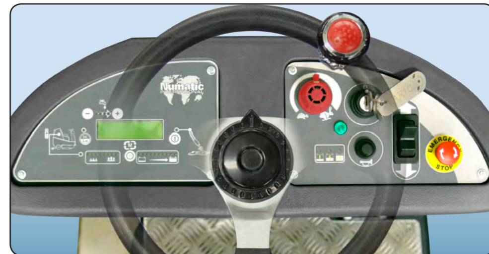
Full control dashboard