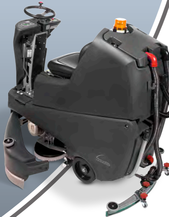
Easy brush access

The TRO650G is blessed with a commanding operator driving position, front wheel traction drive, a magnificent turning circle and one pass performance that really will ensure you get the standard you want, exactly when you want it... and fast.