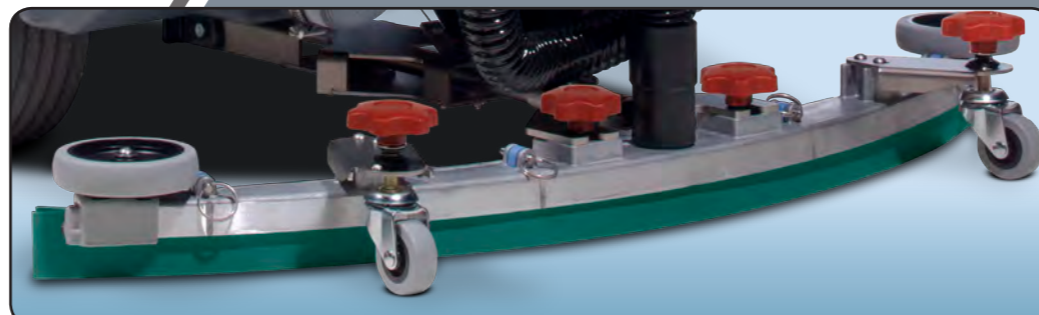
TRO Aluminium / Polyurethane floor tool