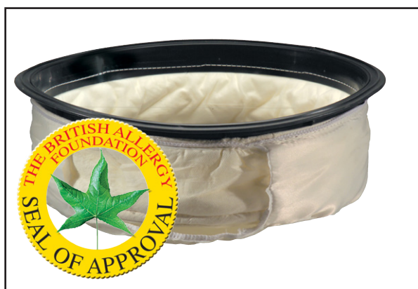
Optional HEPA Filter Upgrade