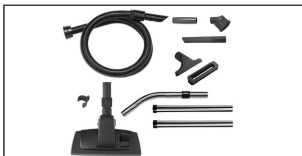
Comprehensive toolset with Stainless Steel Wands