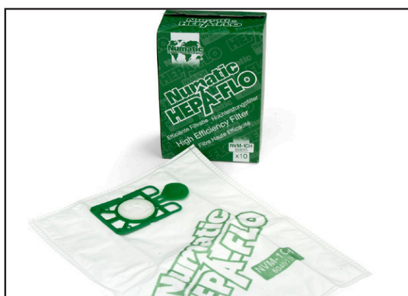
High Efficiency Hepa-flo Bags