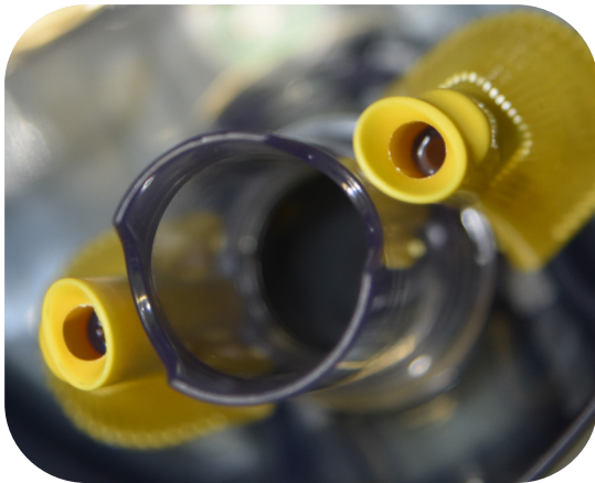
Patented RAIN SYSTEM water filter with Venturi technology

This ergonomically shaped handle is made of stainless steel and is, therefore, particularly robust.