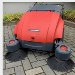
Right unfolded side brush