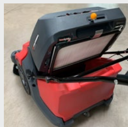
Opening of the dust box for throwing in large parts