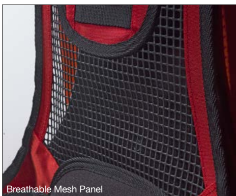
Breathable Mesh Panel