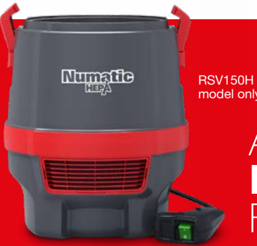
RSV150H model only

HEPA H13 Filtration 99.97% down to 0.3 microns