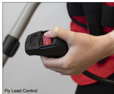
Fly Lead Control