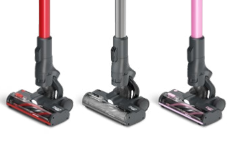
Available in Henry Red, Graphite and Hetty Pink.