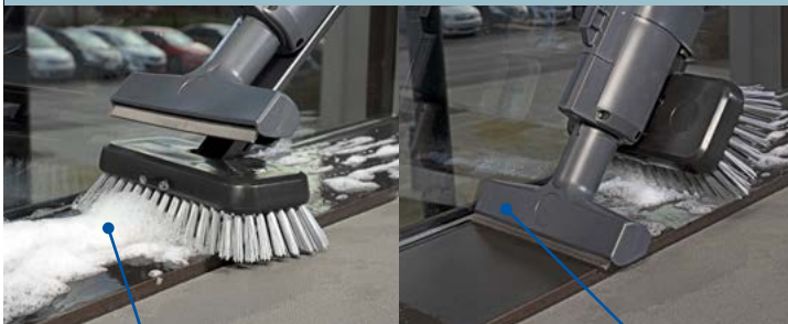
Awkward, Hard-to-Reach Spots