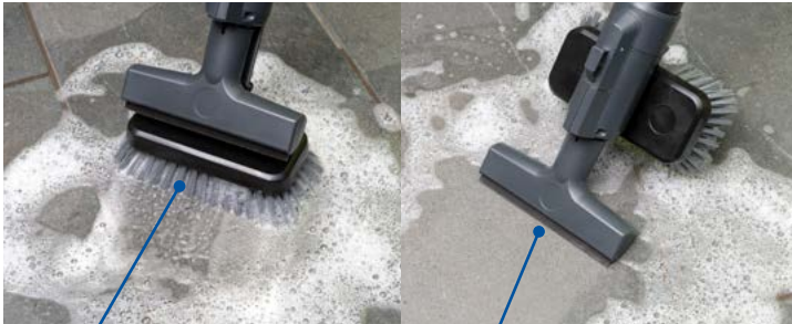
Spray + Scrub